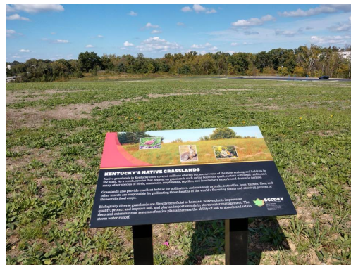
Educational Signs at Gateway Community and Technical College