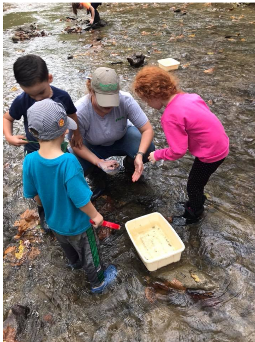
Habitat Exploration in Middle Creek